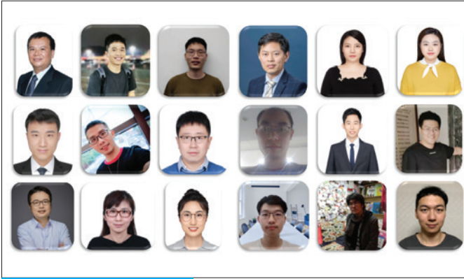
IEEE 2941 Working Group